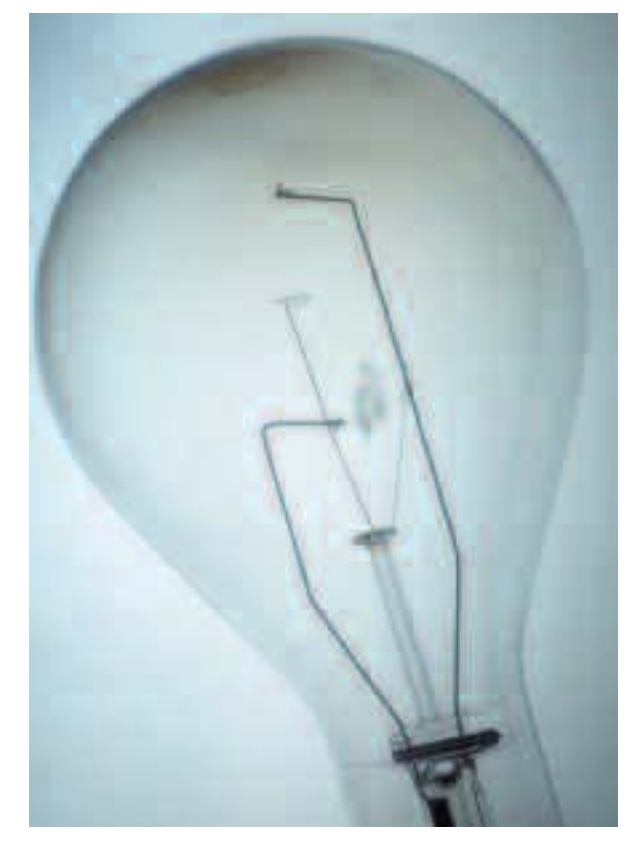
tax credits that will encourage consumers to buy energy-efficient hybrid cars and trucks,

We're encouraging automakers to produce a new generation of modern, clean diesel cars and trucks. My administration has issued new rules that will remove more than 90 percent of the sulfur in diesel fuel by 2010. Clean diesel technology will allow consumers to travel much farther on each gallon of fuel, without the smoke and pollution of past diesel engines. We've proposed $2.5 billion over 10 years in